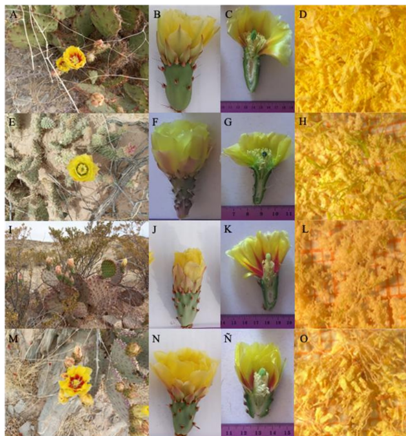
Figure 1. View of plant flowering, entire flower, longitudinal section, and stamens with pollen from O. engelmannii (A, B, C, D, respectively), O. arenaria (E, F, G, H, respectively), O. macrocentra (I, J, K, L, respectively), and O. microdasys (M, N, Ñ, O, respectively).